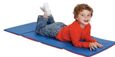
Rest Mat (45"L x 19"W x