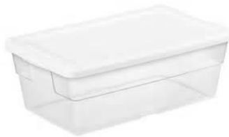
14" x 8" x 4 7/8"